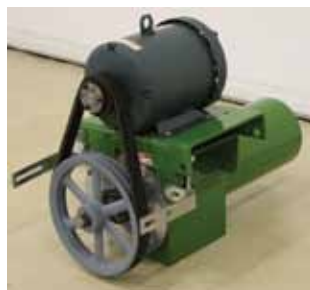
Single Motor Horizontal Drive