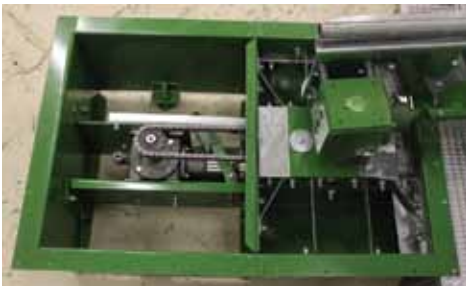
Shields removed to show detail. Keep shields in place.