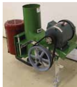
Two Motor Vertical Drive - Top or Bottom

Also Available: 8" Power-Take-Off Horizontal Drive