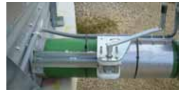
Rack & Pinion Opener