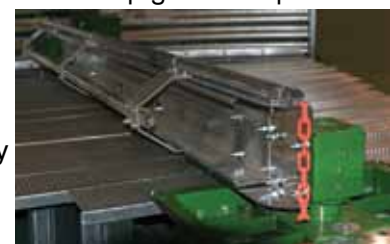
Grain Buster Option