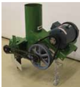
Single Motor Vertical Drive